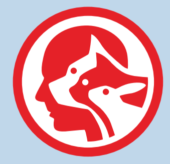
Companionship – make sure your pet's social needs are met