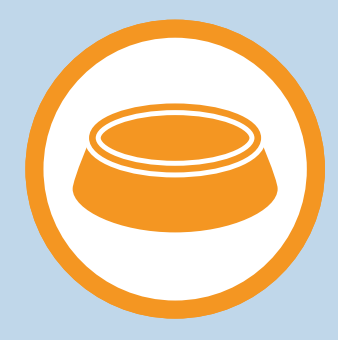
Diet – make sure your pet is fed a suitable diet for its age and breed