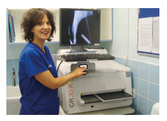
All of our PetAid hospitals now have state-of-the-art digital x-ray processors

Other veterinary-related projects included the successful completion of a five-year rollout of digital x-ray processors to our PetAid hospitals. Additionally, we began to replace our ageing computerised practice management system with a more up-to-date platform called Jupiter VetSpace.